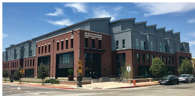
The new K Residence Hall

The University's newest student housing expansion, The K Residence Hall, is now open providing 401 beds in 110 units. The historic Villa Park Packing House connects via an inviting plaza and is being restored; it will serve as the future home of the school's noted Dance Studios. Parking capacity at Panther Village on West Chapman Avenue has been expanded, allowing student housing to increase from 108 to 222 beds. The 300 unit Chapman Grand Residence purchased last year on Katella Avenue is now at capacity, housing more than 900 students. There's additional housing to come on the school's I-5 property next to Panther Village.