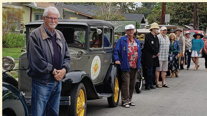
OTPA's parade of antique autos.

We work with City staff to collaborate with residents, business owners and developers early in restoration and preservation planning so the charm of Old Towne is maintained. We also attend City Council, Design Review Committee, and Planning Commission meetings.