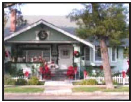
Most Old-Fashioned: 413 E. Maple