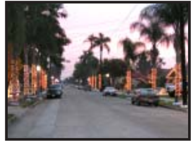
Best Block: 200 Block of N. Pine